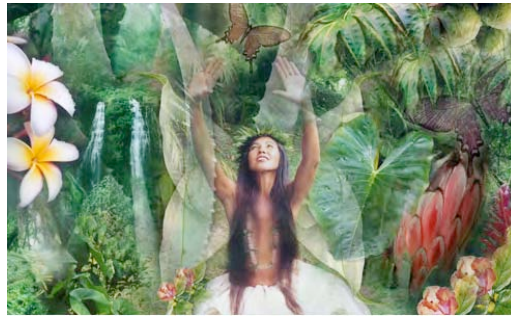
“Healing Garden” © 2009 CarolynQuan.com

• East Hawaii Cultural Center, Hilo, Big Island